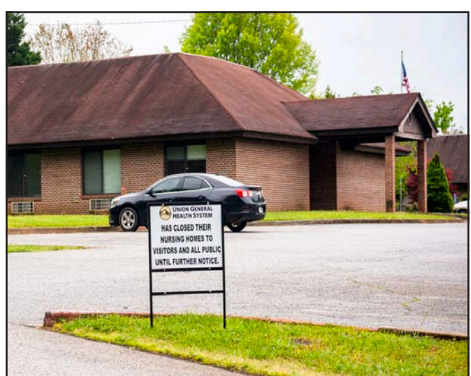
Due to the pandemic, the Chatuge Regional Nursing Home is closed to visitors until further notice.

Recently, the Centers for Disease Control and Prevention issued new guidance recommending mass testing of residents and health care professionals inside nursing homes where a positive test