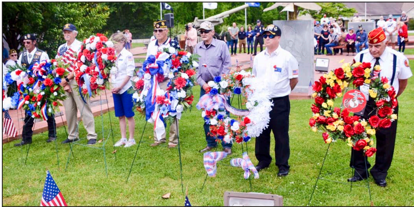
The laying of the memorial wreaths is always an important part of the annual Towns County Memorial Day Service.

"We know what freedom is; we are living it right now," See Memorial Day, Page 8A