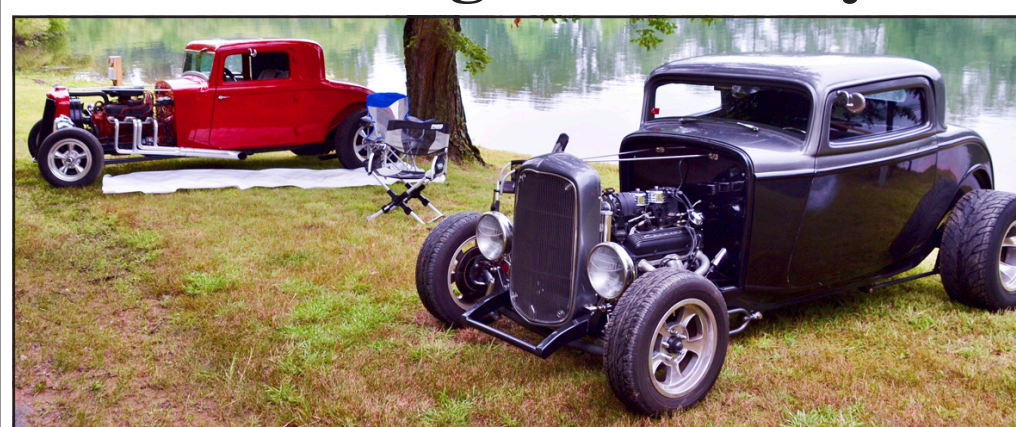
This summer, the Annual Georgia Mountain Moonshine Cruiz-In will once again rev its way into the Georgia Mountain Fairgrounds, this year with special COVID-19 precautions in place.